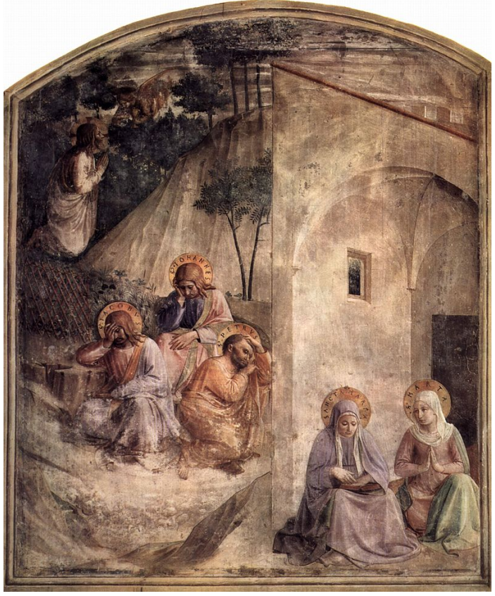
Fra Angelico, fresco, c. 1437-1446. Museum of San Marco, Florence, Italy